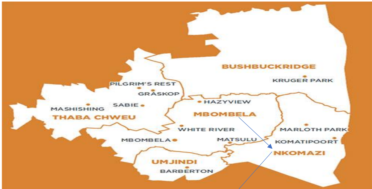
Figure 1. Map of Ehlanzeni district

population in this community is 8.202. The community is deeply rural with red textured soils which are conducive for most crops. Farmers in this community practise diversified farming, for instance they own cattle, pigs, chicken, goats, sheep, and some are into fishing. They also grow a variety of crops such as maize, citrus, sugarcane, legumes, tobacco, banana, cassava, and vegetables.