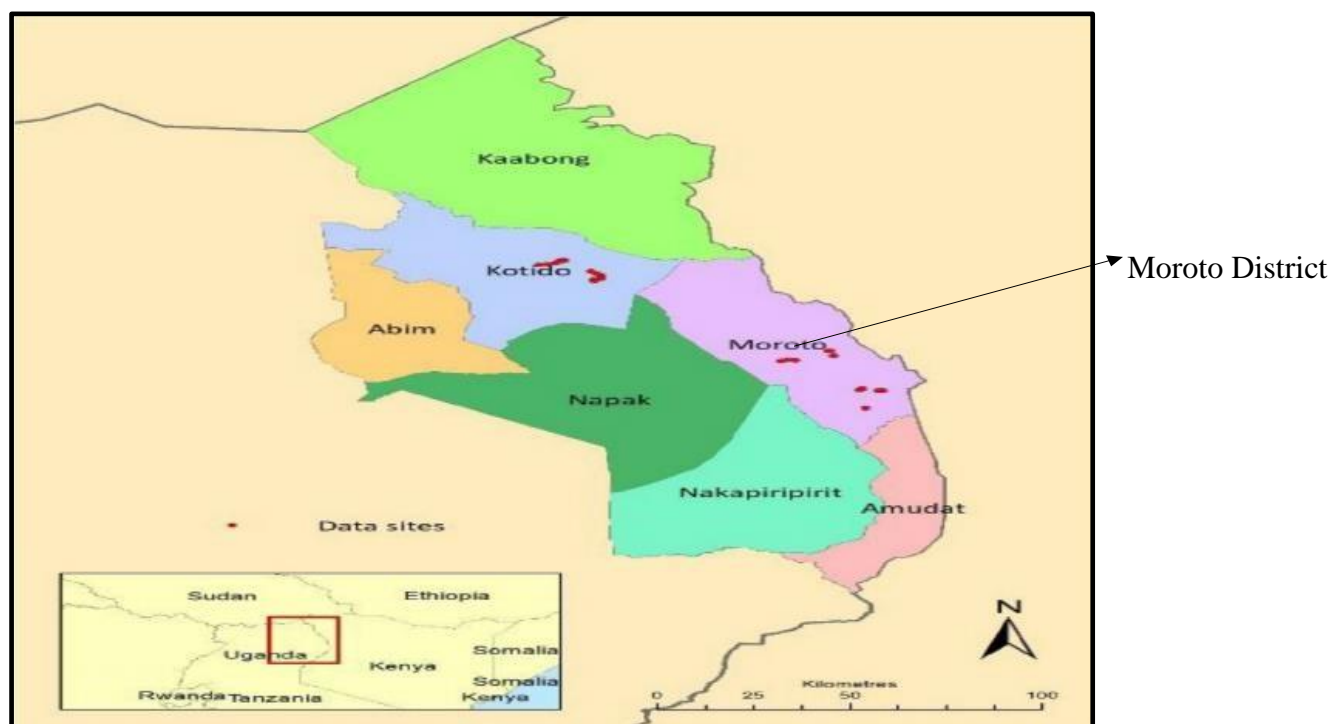
Figure 1: Map showing the study area