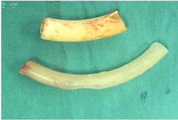
Figure 4: The fragment of the tracheostomy tube removed consisting of two fragments: the outer sheath, which fractured at the site of the fenestration, and the inner tracheostomy tube, which fractured at the junction of the neck plate and tracheostomy tube.

Various techniques have been described regarding the removal of a tracheostomy fragment; the ideal technique is by direct vision, with the use of a bronchoscope. In most cases, general anaesthesia was performed and one case reported using conscious sedation. 11 If the fragment is still in the upper trachea, it may be removed with a pair of forceps through the tracheostomy stoma. Deeper fragments may require a rigid bronchoscopy, which may be inserted orally or through the tracheostomy stoma site. In one case, a technique was described using a Foley catheter to remove a tracheostomy fragment and in another case a thoracotomy was required as the fragment had eroded through the trachea. 12 Femorofemoral cardiopulmonary partial bypass can be considered in patients with failure to oxygenate if the situation permits. One case was reported where a child died before it was possible to remove the tracheostomy fragment as the child had a severe tracheal stenosis and the aspirated fragment occluded the carina. 10