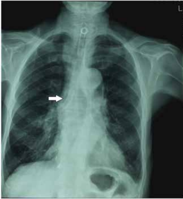
Figure 1: Chest X-ray postero-anterior view showing the fragment of the tracheostomy in the right main bronchus.