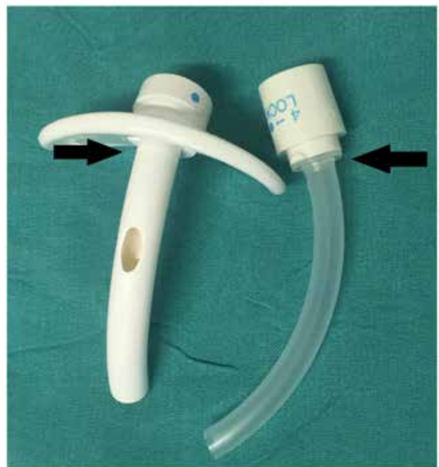
Figure 3: A PVC fenestrated non-cuffed tracheostomy tube similar to the one which fractured. Arrows indicate the junction site between the neck plate and tracheostomy tube, where a fracture is most likely to occur.

In cases in which the tracheostomy has been used for a prolonged period of time, a high index of suspicion is necessary for the diagnosis as the patient can often be misdiagnosed as having an airway infection. Confirmation of the position of the fragment can be done with chest radiograph – tracheostomy tubes are radio-opaque – or by computed tomography.