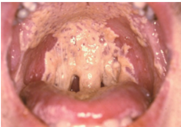
Figure 3: Candidiasis of the mouth

Pulmonary tuberculosis is the scourge of our time, and the explosion of cases in recent years is undoubtedly a consequence of the uncontrolled HIV epidemic in the last two decades of the previous century. South Africa has one of the highest infectivity rates of Mycobacterium tuberculosis in the world. The spread of M. tuberculosis in the general population has exponentially risen with increased immunosuppression from HIV. 26 In addition, Mycobacterium resistance [multidrug-resistant tuberculosis (MDR-TB) or extensively drug-resistant tuberculosis (XDR-TB)] is increasing. 27,28 Co-infection with HIV