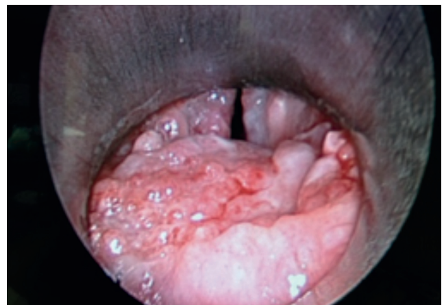
Figure 4: Laryngeal tuberculosis