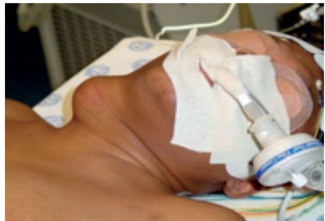
Figure 7: Carotid artery aneurysm in a young woman

The anaesthetist is uniquely positioned to detect manifestations of HIV/AIDS around the head and neck. Although the anaesthetic course is unlikely to change for most patients, the manifestations may provide a clue with regard to the patient's HIV status. Airway management may be difficult in some patients owing to bulk masses, such as tumours, infections and aneurysms. At times, it may even be life threatening. It has to be remembered that this disease has other systemic effects, such as cardiac, pulmonary, haemopoietic and central nervous system manifestations, and that these may influence the outcome of anaesthesia.