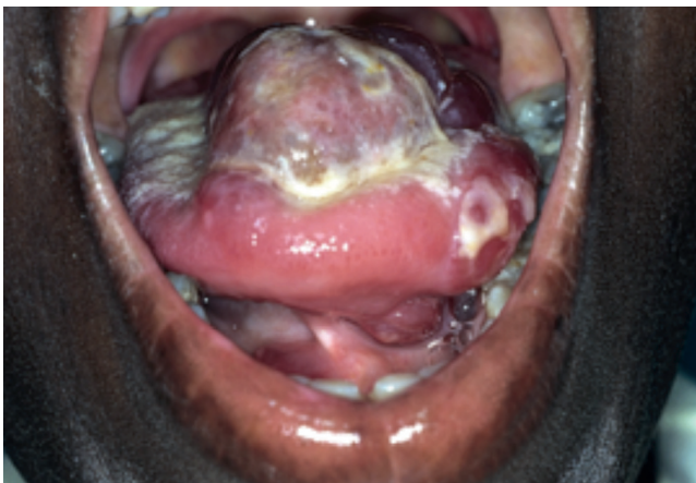
Figure 6: Kaposi's sarcoma of the tongue

Vessel wall aneurysms appear to have a predilection for carotid arteries (Figure 7), and there is a danger that these patients will be booked for incision and drainage for what appears to be a bacterial abscess.