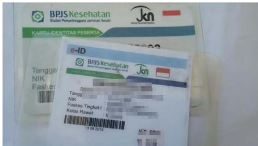
Figure 1. BPJS card that can cover treatment fee for HIV/AIDS and OI without complication.

Additionally, B1, B2, B3, and B5 always buy multivitamin to maintain their body stamina. They spend about IDR 70,000 – IDR 100,000 monthly. Meanwhile, B6 should buy formula milk monthly to fulfil her HIV-infected baby's nutrition, because she as PLWHA may not breastfeed her baby exclusively. A 900g-box of formula milk costs IDR 319,000.