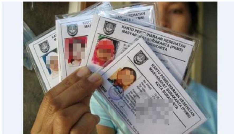
Figure 2. BKMKS card covering HIV/AIDS treatment fund particularly for poor people in Surakarta.

immunological or clinical failure. CD4 should be examined periodically to ascertain the treatment response. A2, C3, C4, C5, C6 and C7 argued that the largest laboratory cost is used for Viral Load, CD4, Rontgen, and liver function examination. However, B1, B2, B4 and B6 spend no fund for laboratory examination because of Surakarta City Government's policy supported by Global Fund-AIDS Tuberculosis and Malaria [GF-ATM] manifested into the NGO-caring about AIDS programme in Surakarta.