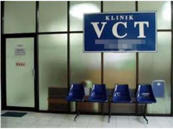
Figure 3. VCT Clinic Facilities in one of Public Hospital in Surakarta.

ART treatment, 486 reported died, 36 ceasing ART, 420 absent or failing to be followed up, and 249 referred to other hospital. This data is displayed in Figure 4.