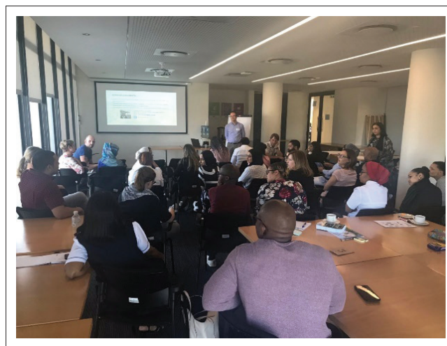
FIGURE 1: Local collaborators from the Western Cape Department of Health.