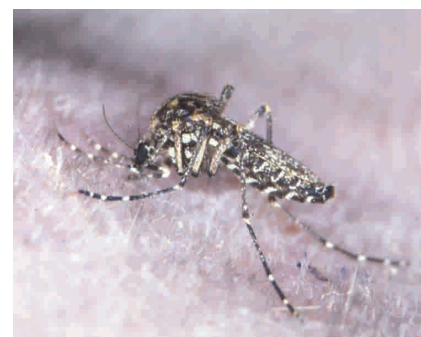
Figure 2: Aedes furcifer – vector of chikungunya

Human outbreaks of chikungunya occurred in the eastern Northern Province in 1956, 11 1975/76 9 and 1977 12,13 and in southern Zimbabwe in 1961/62 14 and 1971. 15 More recently in 2001 one case of chikungunya was diagnosed in a person who had stayed in the eastern Northern Province. 16 An epizootic in monkeys without human cases is known to have occurred in northern KwaZulu Natal in 1964. As has been discussed previously, in the absence of extensive evergreen rain forest in southern Africa with an enzootic vector like Aedes africanus , it is unlikely that a mosquito-monkey forest cycle occurs for viral maintenance. Vertical transmission by the Ae. furcifer group, following virus survival in the egg stage, does