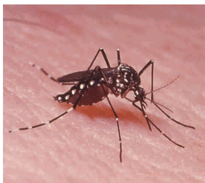
Figure 3: Aedes aegypti , urban vector of the dengue virus

for the viruses. An enlarged spleen and anaemia, symptoms developing after about one week in malaria, are not characteristic of the viruses. All these viruses except Rift Valley fever usually cause a rash that is another difference from malaria. However, a person who develops a significant fever after having been in a malaria area should always have his blood examined or tested for malarial parasites.