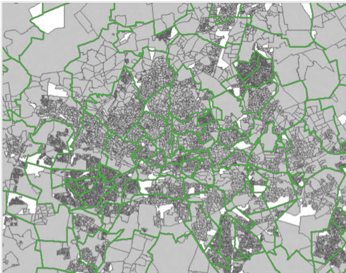
Figure 2: Image of the overlay of precinct boundaries (green lines) with the SAL layer

70% within precinct B, 30% of the population and all related census data are allocated to precinct A, and 70% of the population is allocated to precinct B. Adding up all the small areas and partial small areas within each precinct then gives us an estimated population per precinct.