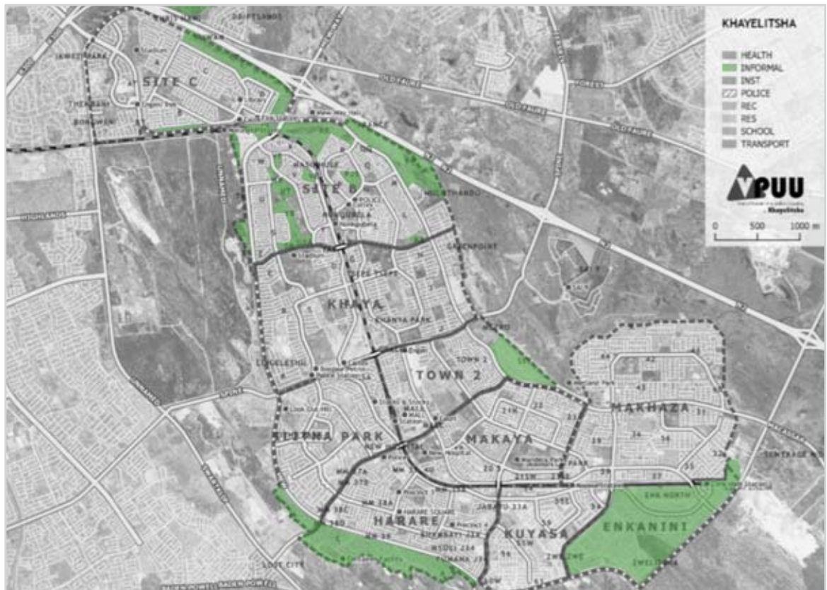
Figure 2: Map of Khayelitsha