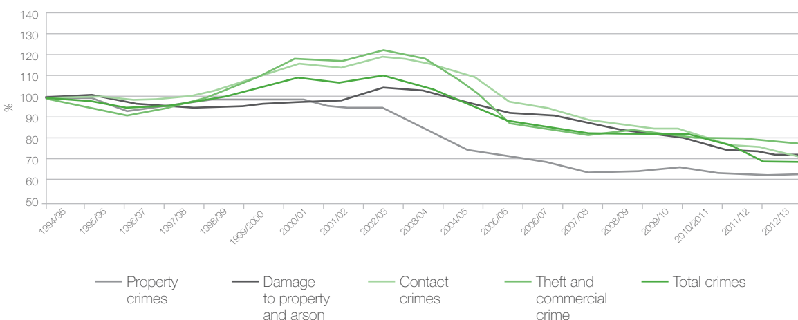
Figure 1: Serious crimes 1994/5 – 2012/13

It is difficult to accurately determine the levels of organised crime anywhere, and South Africa is no exception. 35 Statistics and research on organised crime offer contradictory accounts. For example, while vehicle theft, which often has an organised crime component, 36 dropped from 88 144 incidences in 2004 to 58 312 in 2013, 37 incidences of rhino poaching jumped from 22 to 1 004 in the same period. 38 Similarly, while there was an increase in drug arrests, 39 social research on drug use and gang influence seems to suggest that there has not been a significant change in drug use. 40 The increase in drug arrests could indicate better enforcement rather than an increase in drug trafficking. Or this could be due to factors such as a loosening of power monopolies and