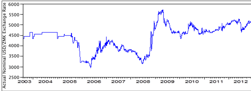
Figure 1: Nominal daily USD/ZMK exchange rate from 1 August 2003 to 31 December 2012 indicating a non-stationary series

The nominal exchange rate is non-stationary, while the exchange-rate returns are stationary.