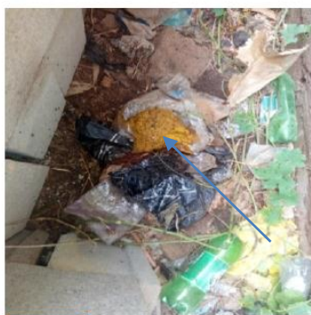
Fig 2: Feces of a human

drop of the mixture was placed on a clean glass slide using a clean pipette. A cover slip was placed on the mount and placed under a microscope with the objective lens set at 10x to search thoroughly for parasites. The identification of the oocysts/eggs/larvae were done based on their characteristic morphology with the aid of Cheeseborough (1998) and Soulsby (1982).