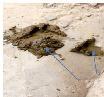
Fig 4: Feces of a cow