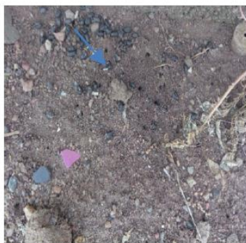
Fig 3: Feces of a goat