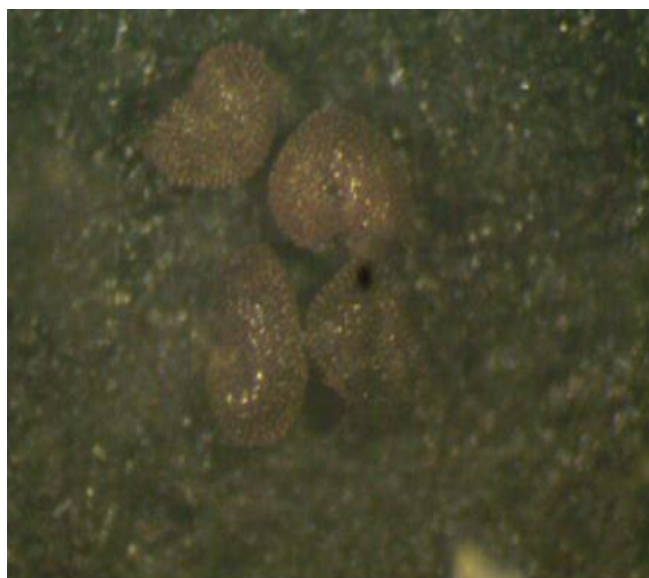
Fig. 3: Lenticulina stellata