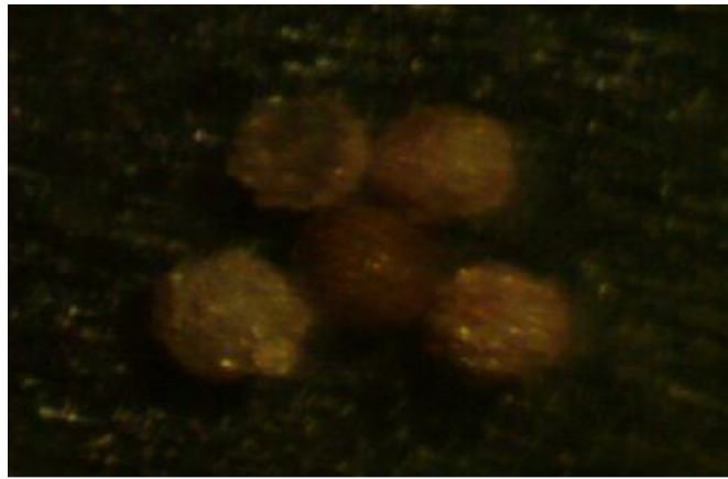
Fig. 4: Saccamina sp.