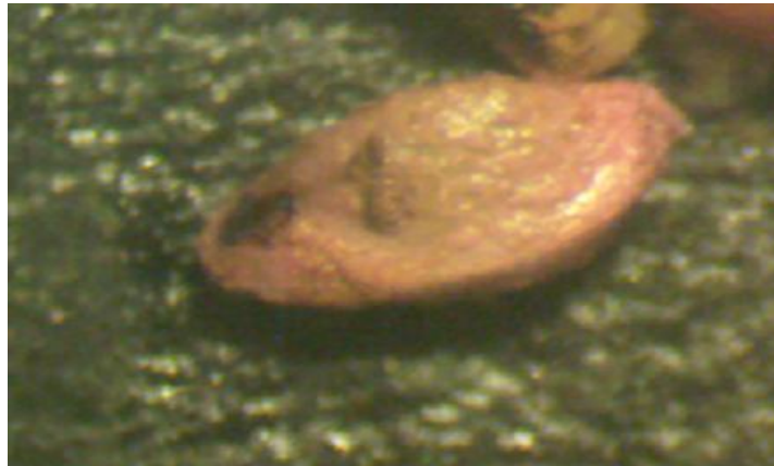
Fig. 8: Trochammina sp