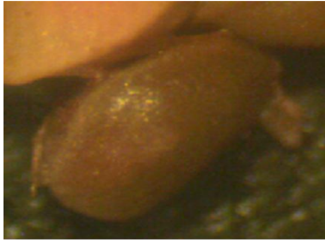
Fig. 7: Ostracoda