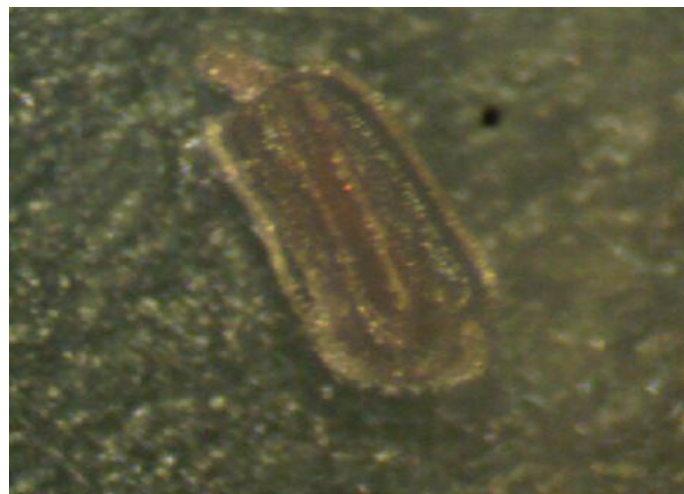
Fig. 6: Marginulina cf planata