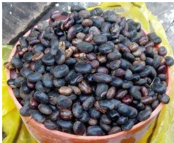
Figure 1: Mucuna pruriens seeds

A total of 64 adult albino rats comprising thirty-two (32) male and thirty-two (32) female rats of the Wistar strain, weighing 93.81 g - 155.1 g were used for this study. The rats were housed in a well ventilated and spacious room (27°C±3°C). Animals were acclimatized for 10 days with water and fed ad libitum with rat chow purchased from Animal Care Services Konsult (Nig.) Ltd before the commencement of the experiment.