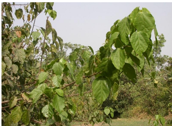
Figure 1: Alchornea Cordifolia Leaves

Alchornea Cordifolia ( Figure 1 ) belongs to the family of Euphorbiaceae, having a chromosome number of 36.