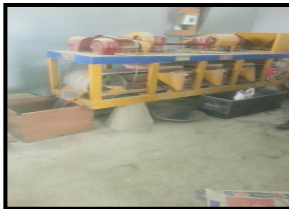
Plate 4: Coltant processing at warehouse