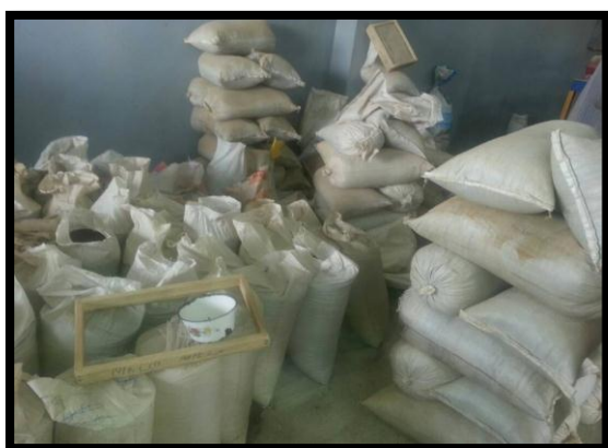
Plate 3: Coltant products storage at warehouse