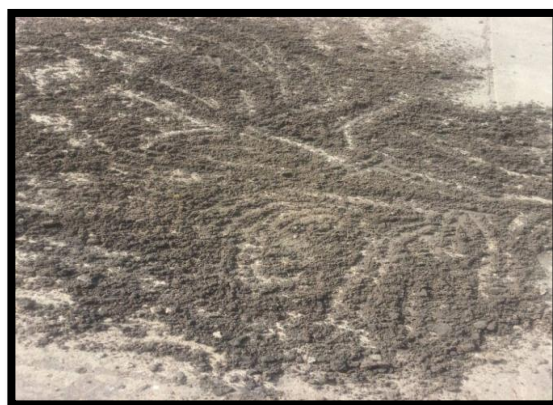
Plate 2: Air drying of coltant at warehouse