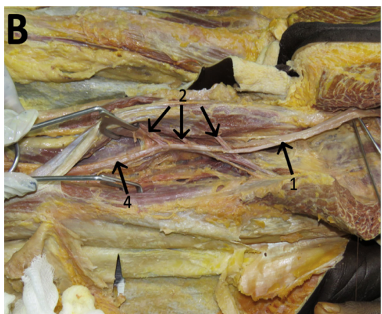
Figure 1B: (1) Proximal sciatic nerve (2) Three perforator arteries from profunda femoris, (4) Distal sciatic nerve

The sciatic nerve course was observed from the infra-piriformis towards the distal; however, in the proximal mid-thigh, we found a sciatic nerve loop allowing passage to 3 muscular perforator arteries, and it rejoined the main sciatic nerve distally; there was no kinking or compression effect on the perforators as the loop was large.