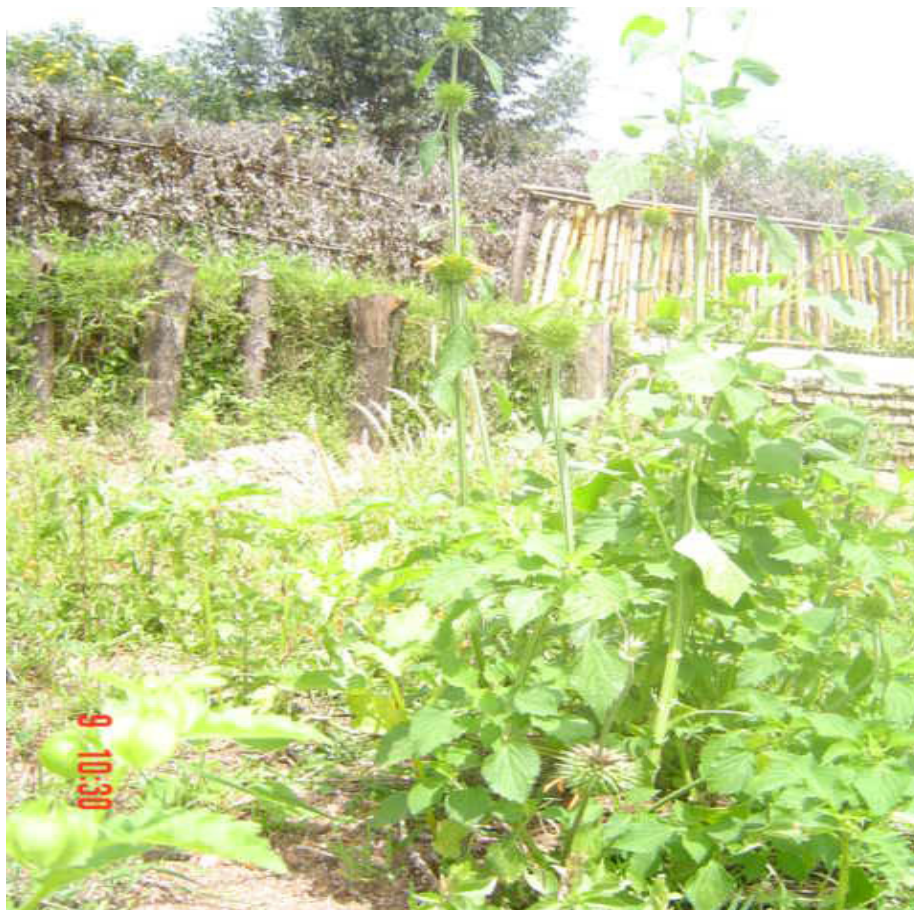
Figure 1: Leonotis nepeatafolia

temperature. Then, they were milled into powder using electric blinder, Janke-Kunker.