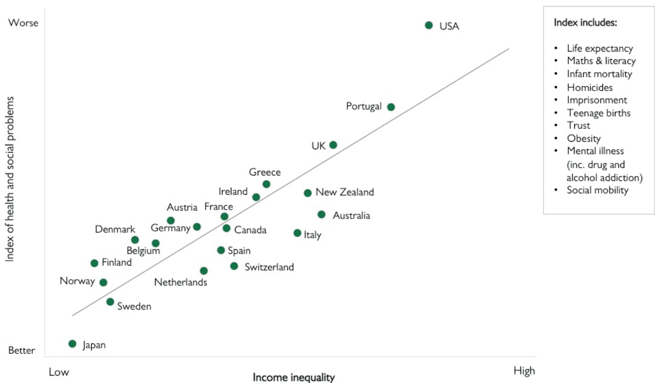
Figure 2: Comparing unequal income levels with health and social problems by country

Neo-liberalism, as a set of beliefs about the nature of economic life and policies, has established a global orthodoxy, adopted with particular zeal in anglophone countries. Its prescriptions suggesting that the market knows best and that state economic interventions are inefficient and counter-productive have the