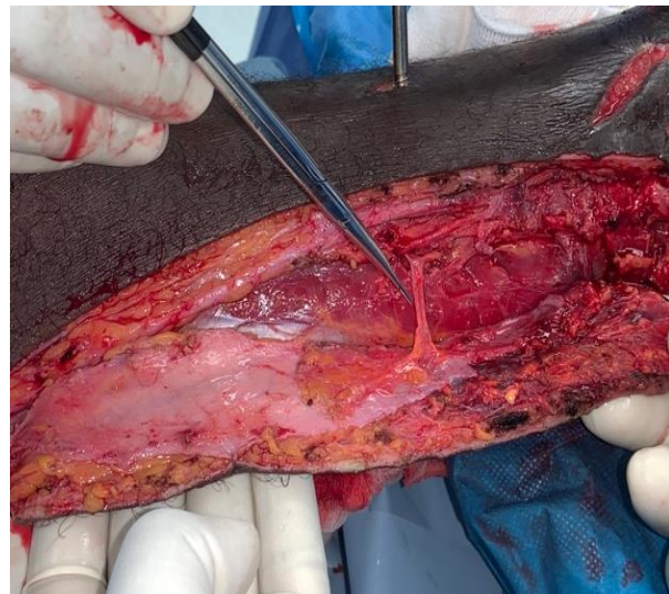
Figure 3: Flap raised with perforator skeletonized