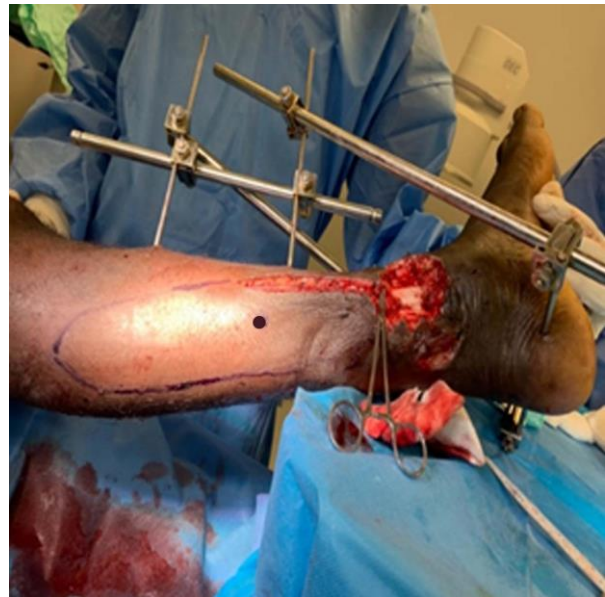
Figure 2: Flap marked out with pivot point (dotted)