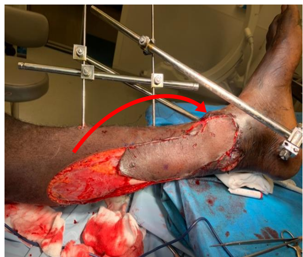
Figure 4: Flap inset after 180° rotation, shown with arrow