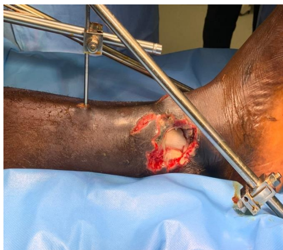
Figure 1: Open tibial fracture distal third of leg