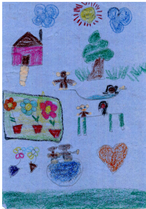
Figure 4: Drawing by grade 1 child depicting children at play

The activities included watching television and listening to children’s programmes and stories on the radio. When they have some money for buying chips and sweets, they do not mind walking to the shop, e.g. “We walk to the shop – it’s not far – then we buy sweets”. Going to town over the weekend seems to be a highlight for them (“On Saturdays and Sundays we go to the shops”). They also mentioned playing with the family dog, swinging or playing with a ball, a toy car made of wire, a doll’s house, and participating in games: “We play a game of ‘touch’ (Afrikaans: Jagentjies ). When I catch him, he must chase me.” The participants mentioned playing with friends, siblings or the soft toy, e.g. “One of my school friends went with”, and “I play a little bit with Flappie (soft toy dog)”. Excursions were usually undertaken with family members, extended family, neighbours, the teacher or the farmer.