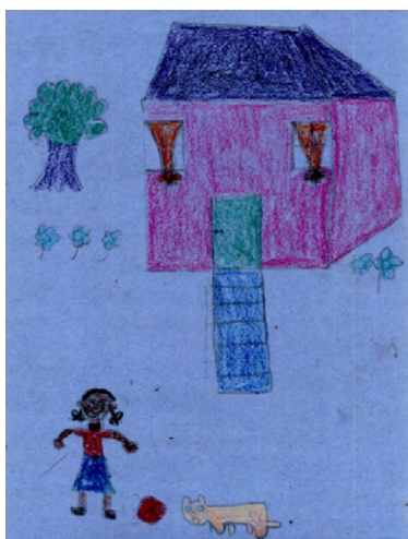
Figure 1: Drawing by grade 3 learner of her home

The drawings of the children all depict very basic and small homes (see Figure 1) set close to each other, usually one-roomed or one bed-roomed. The drawings compare well with the photograph of a home (see Figure 2) taken to visually document the context of the research. The homes are not equipped with running water and water has to be collected from the river or the dam, as one of the children indicated, “We draw water for washing from the dam” and “we fetch the water in a bucket”. The homes do have electricity. To heat the water for bathing they have to “boil the water in the kettle”. The small homes are often overcrowded, as one child indicated that “me, my mom, my dad, my dog, and my little brother sleep there ... [in the room]”. The homes on the farms are also long distances from the nearest shop, which sells the basic necessities, and which they frequent in the afternoons after school to buy some sweets or food stuff for their mother, as the following quotations indicate, “I walked from Boskloof to get to the shop” and “I went to the far shop ... we bought chips and sweets ...”. The school is also a long distance away requiring the teacher to collect some of the children from their homes in the morning and drop them off at home after school.