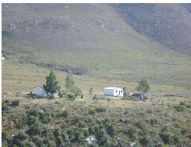
Figure 2: Photograph of some of the children's homes

The isolation and distance from school and town, according to Phometsi, Kruger and Van't Riet (2006), can have a negative impact on children in terms of services and resources; yet these children draw and describe how they go about their daily living to circumvent the apparent challenges. The distance of the homes from resources influences access which impacts on a whole range of activities. Although Bray and Dawes (2007:49) highlight the need for electricity to power computers, none of these participants had computers at home because of their families' low income. However, the children did have access to computers at their school.