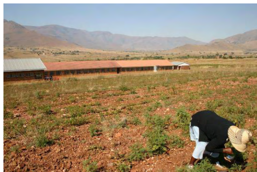
Photograph 4: May 2007