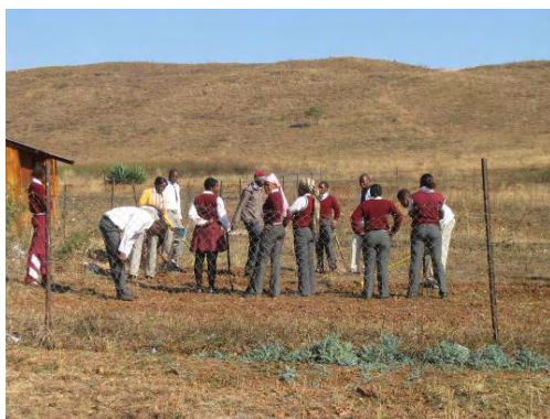
Photograph 5: October 2007