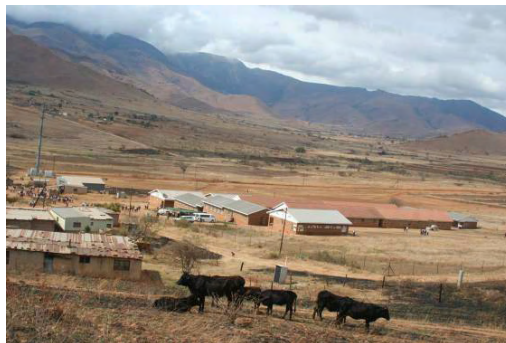
Photographs 1 and 2: Winter 2006 at the secondary school

What we describe in this article is another image that co-exists as reality with the realities referred to above. We present counter-illustrations of how teachers promote resilience in schools to balance numerous