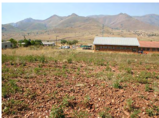
Photograph 6: January 2009

Teachers' agency to support initiatives remained noticeable as observed in the vegetable garden at the rural secondary school. An extensive area on the school grounds was ploughed by a farmer in May 2006 (Photograph 3); mothers weeded the garden in May 2007 (Photograph 4); learners and their teacher worked in the vegetable garden during a Biology class in October 2007 (Photograph 5); a fence was erected around a smaller vegetable garden in April 2008 and more soil turned in the terrain of the smaller vegetable garden in January 2009 (Photograph 6). Teachers also obtained seeds and tools from community members in April 2009, and assembled structures around young seedlings to protect them from goats in April 2010.