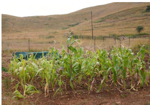
Photograph 3: May 2006

We could best observe the challenge of promoting resilience in the rural schools in terms of vegetable gardens. In urban STAR schools vegetable gardens were established within on average twelve months. Vegetable gardens went through prosperous and scarce cycles depending on climate, availability of labour and seeds, expertise and tools. Once teachers formed partnerships to initiate school-based vegetable gardens, produce was available in one form or another to share with children and their families. In the rural schools these patterns were quite different, as illustrated in Photographs 3-6.