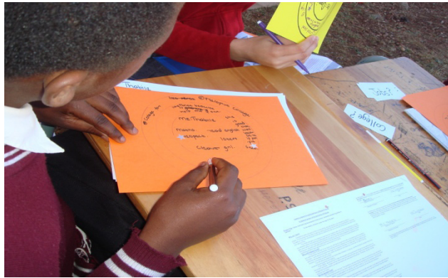
Plate 2: Students and learners implementing the asset-based approach

Pillay (2007) notes that community projects and fieldwork give trainee psychologists the skills they need in order to work with communities, as they give them the opportunity to reach out to people in those communities, while simultaneously gaining experience in testing what they have learnt. This also provides them with the opportunity to test theory in practical situations. The students were given opportunities to test theories during the practicum: “I planned an activity without really linking it theoretically and then later on, it might be days later when the activities are actually done and you are discussing it with someone, then it finally clicks that oh! I’ve been working from this standpoint all the time but I just never got to a point where I’ve integrated the two, so theoretically and in terms of application of all the theories that we have learnt I think it’s been great. Because you actually get a chance to see the theory in action” (P1) and “I felt only asset-based and positive psychology I was able to put in practice” (P2).