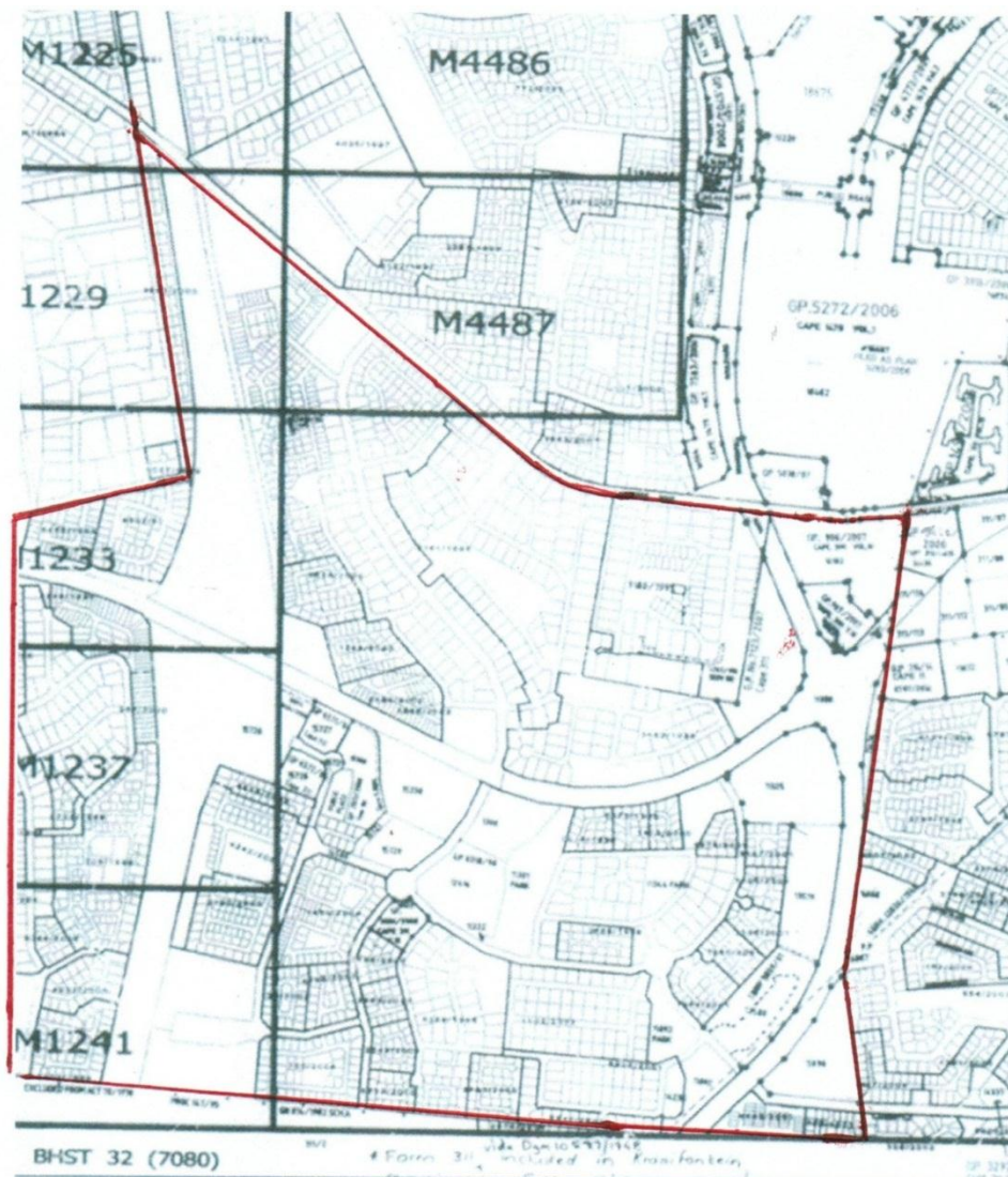
Graphic 3: Subdivision Layout of Sonstraal Heights

A subdivision or "township development" means an area of land divided into erven, and may include public places and roads indicated as such on a general plan. 38 The graphic below indicates the subdivision layout as envisaged by Arun Property Developers (Pty) Ltd.