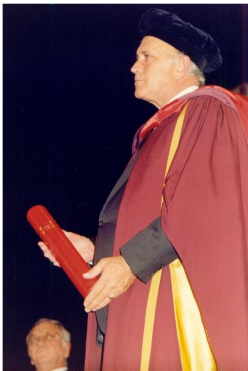
Photo 5: Former state president, FW de Klerk, is an alumnus of the Law Faculty. He completed the LLB in 1958 cum laude. He was awarded an honorary doctorate in 1990 and in 1991 became Chancellor of the PU for CHE. A lecture series named after him was instituted in the Faculty in 2002.