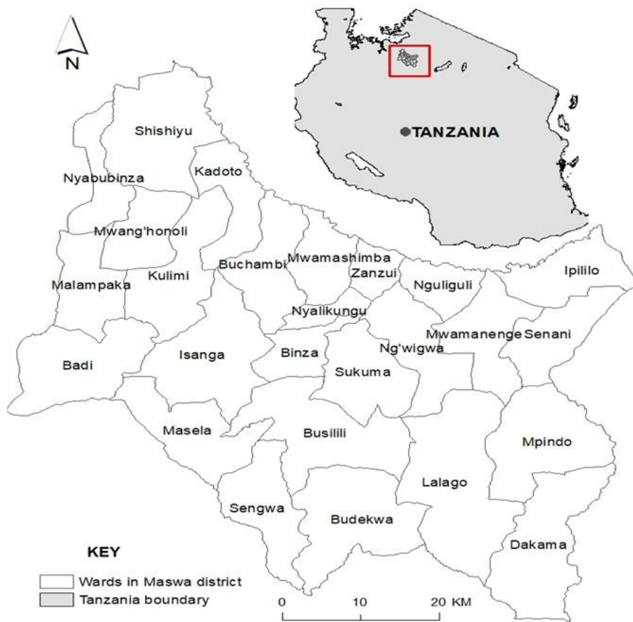
Figure 1: the map of Tanzania (top left corner) and Maswa district showing the wards of the study area