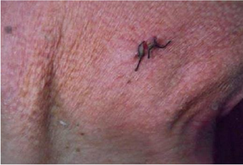
Figure 1: multiple small yellowish papules organized in reticulated pattern in the lateral side of the neck