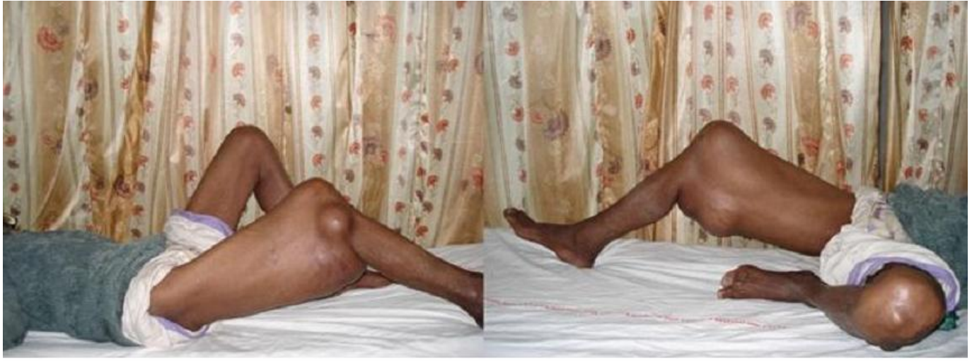
Figure 1 Clinical photograph showing massive swelling of right thigh, mimicking a soft tissue tumor