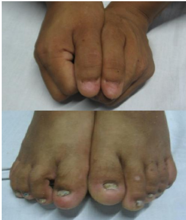
Figure 1 Clinical picture showing dysplastic nails in all digits