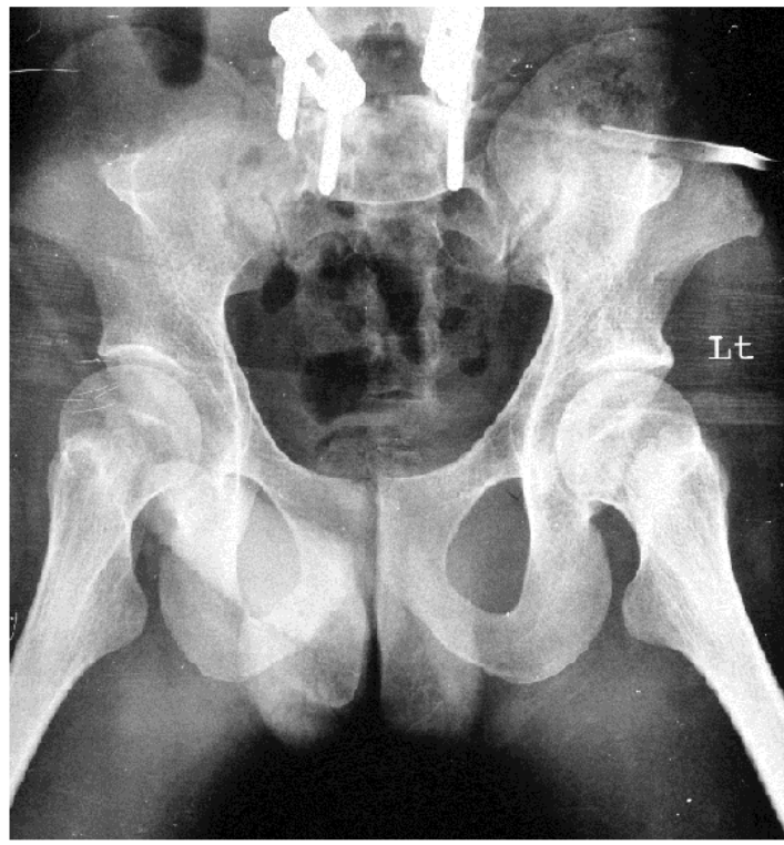
Figure 3 X-Ray of pelvis showing bilateral iliac horns