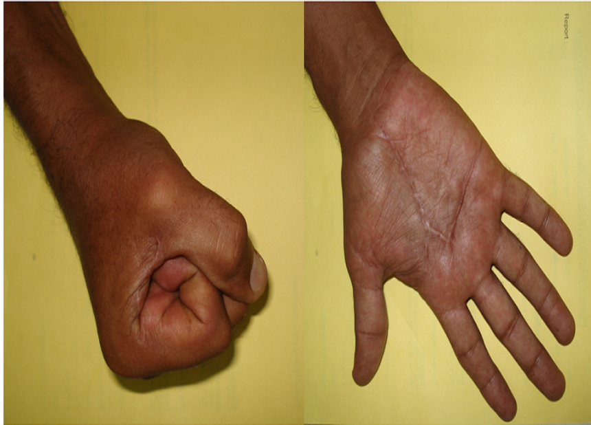
Figure 5 At 2 years follow up, no recurrence with good hand grip