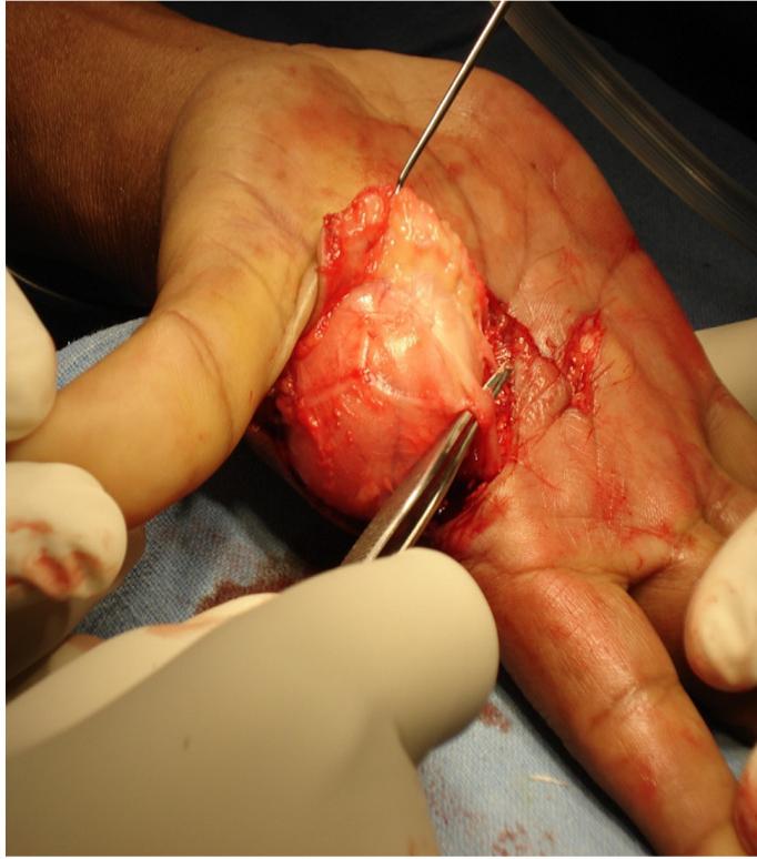
Figure 3 Giant lipoma stretching the median nerve and its branches