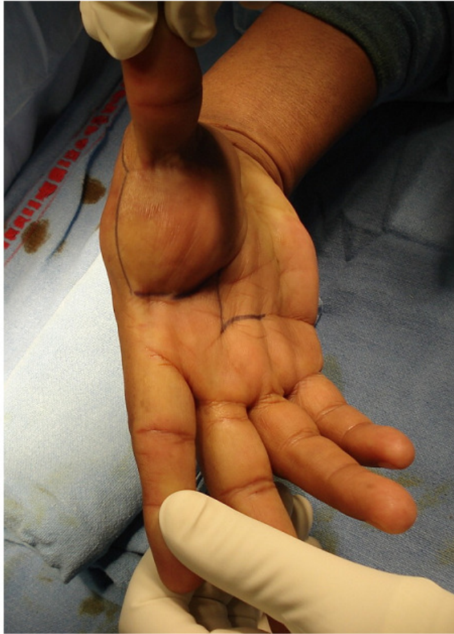
Figure 1 Photograph of the lesion showing the incision marking