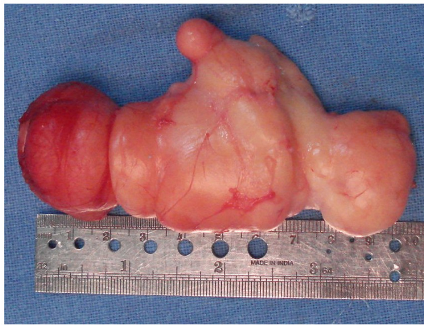
Figure 4 Resected giant lipoma measuring about 10x5x3cm