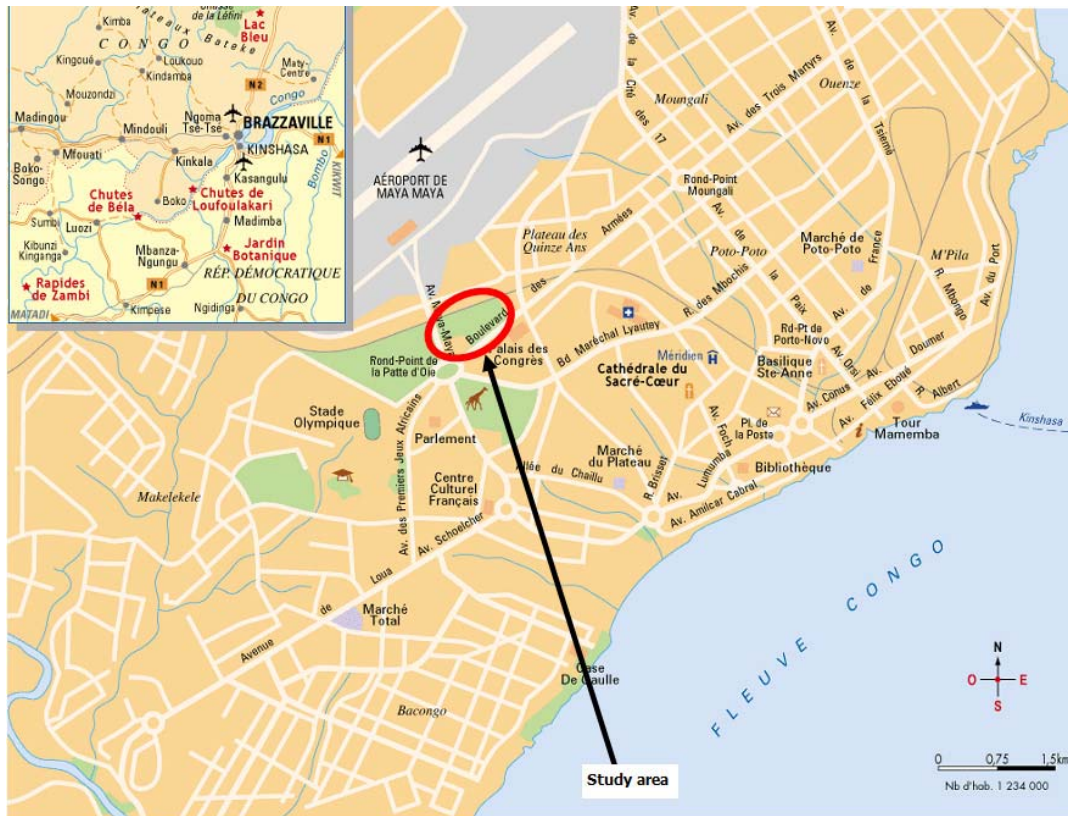
Figure 1: Map of Brazzaville, Republic of Congo (Ref: www.quid.fr)