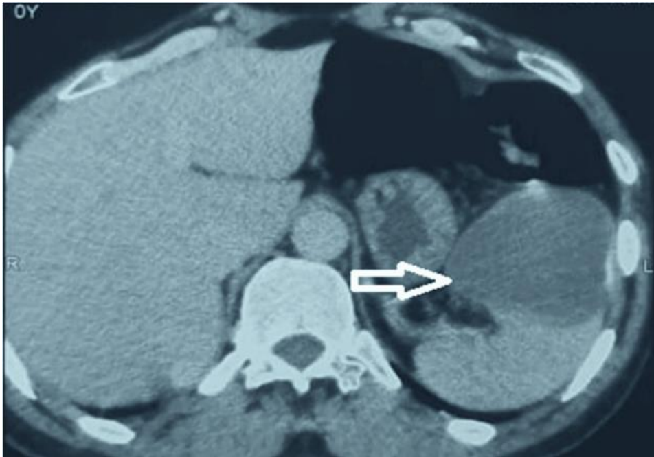
Figure 1: axial abdominal computed tomography (CT) scan showing an uninoculated and well-defined cystic mass in the upper polar of the spleen measuring 115 x 75 mm (white arrow)