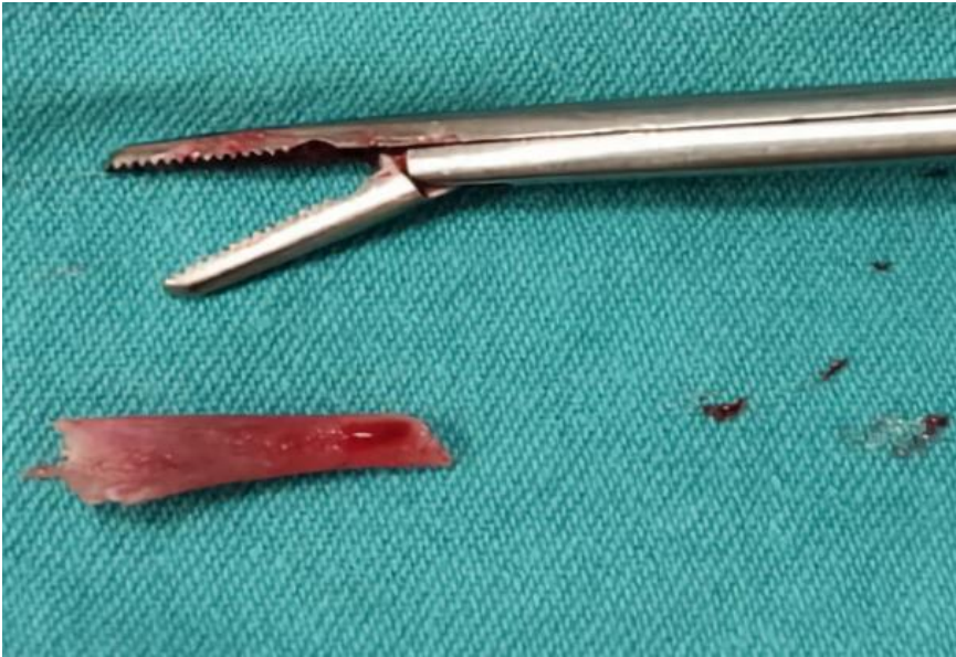
Figure 1: macroscopic view of fetal bone removed from the uterus