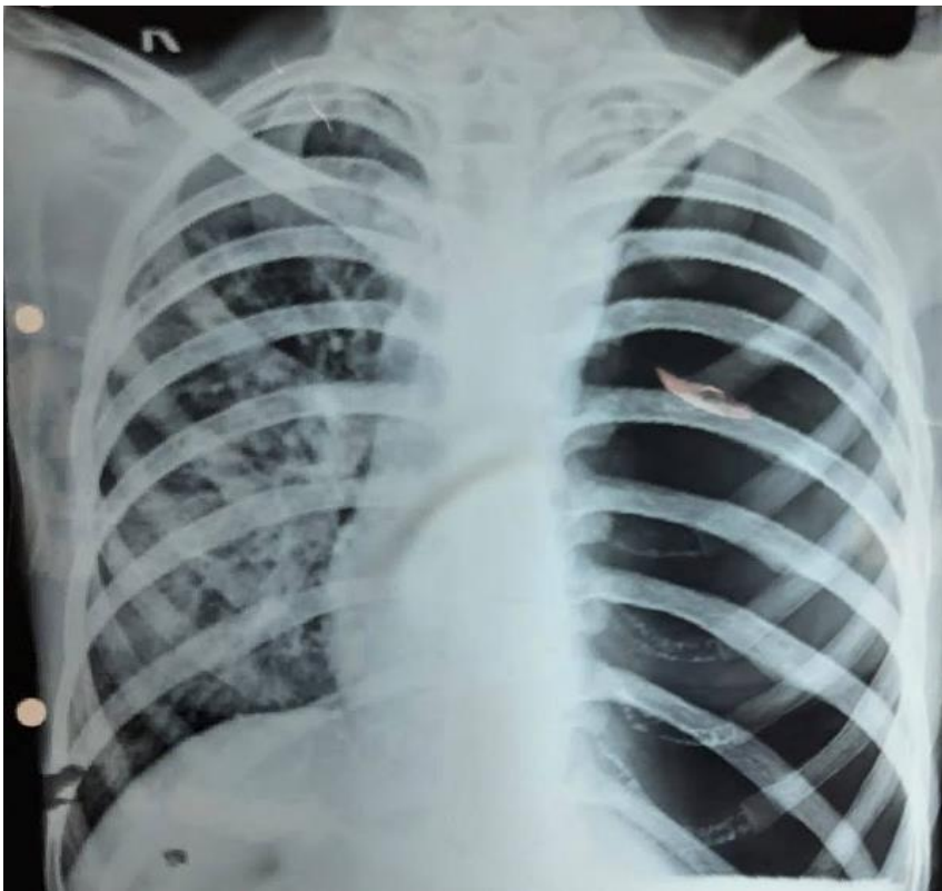
Figure 1: chest X-ray showing tension pneumothorax on left side