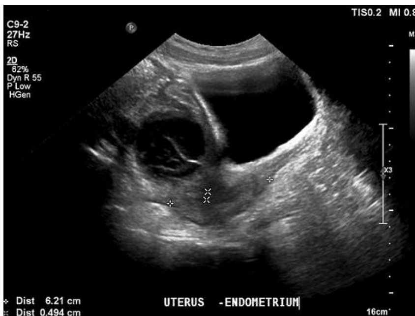
Figure 1: hemorrhagic ovarian cyst features on ultrasonography; ultrasonography revealing an ovoid cystic mass, with regular borders (47 x 45 x 56 mm), hyperechoic elements (possibly hemorrhagic features), multiple internal septations and absence of peripheral or internal vascularity