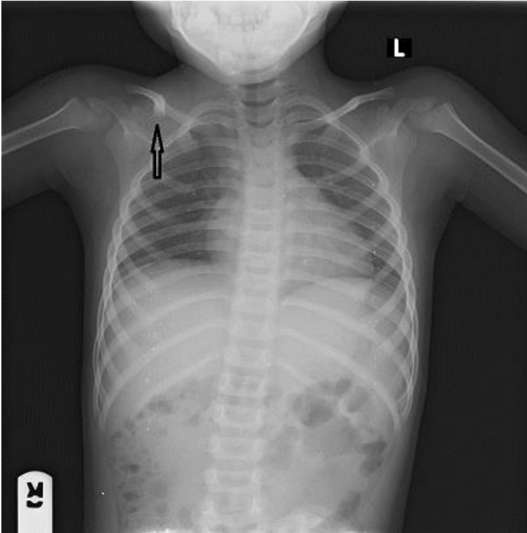
Figure 3: chest radiography showing right clavicular fracture (black arrow)