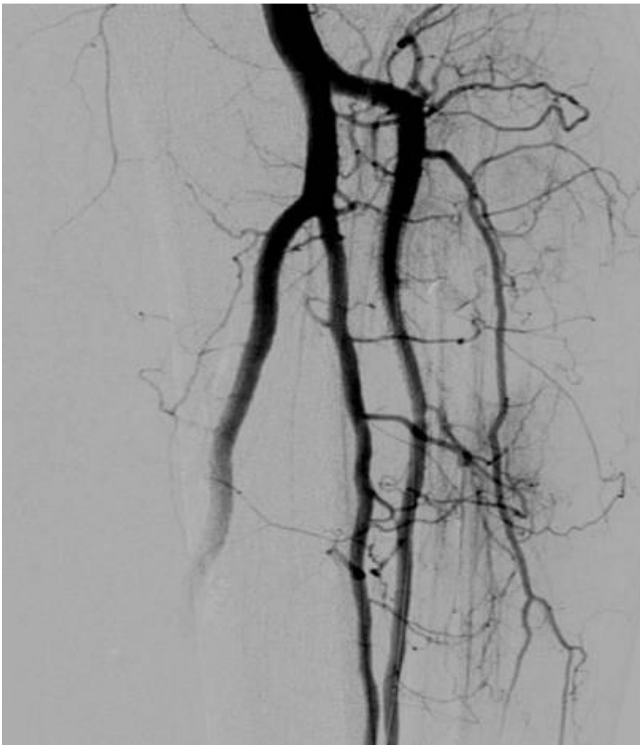
Figure 3: after the deployment of the stent graft, the blood flow through the anterior tibial artery was restored