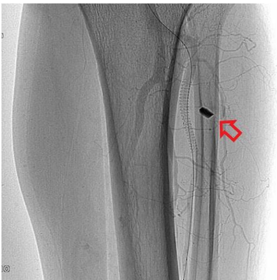
Figure 2: a covered stent was used as treat the anterior tibial artery aneurysm and the traumatic fistula, the metal fragment is easily recognized (arrow)