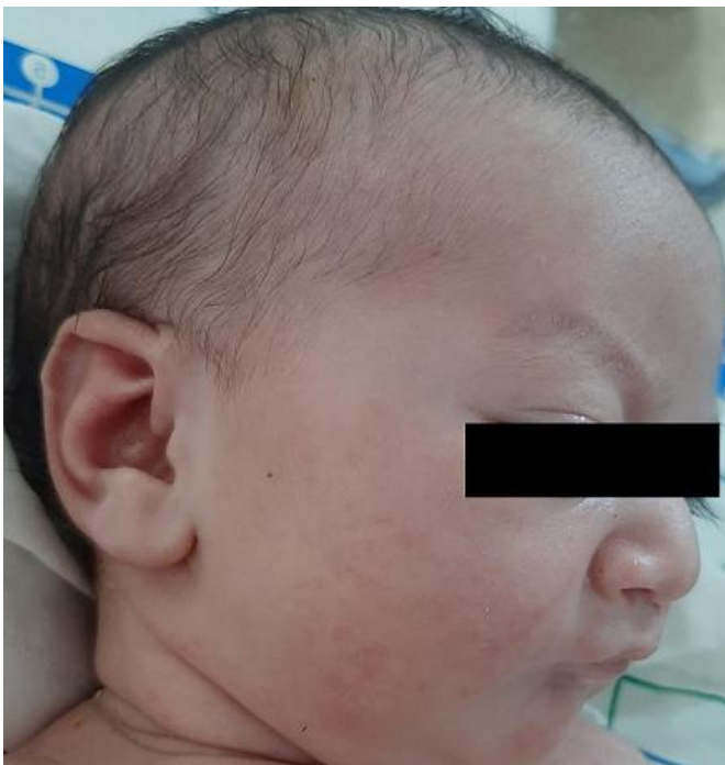
Figure 2: facial features; microretrognathia and prominent nose