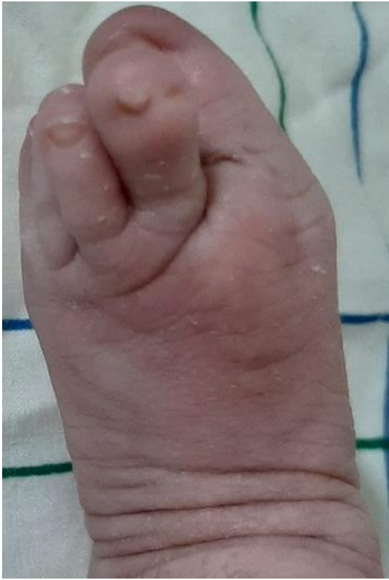
Figure 3: hallux valgus