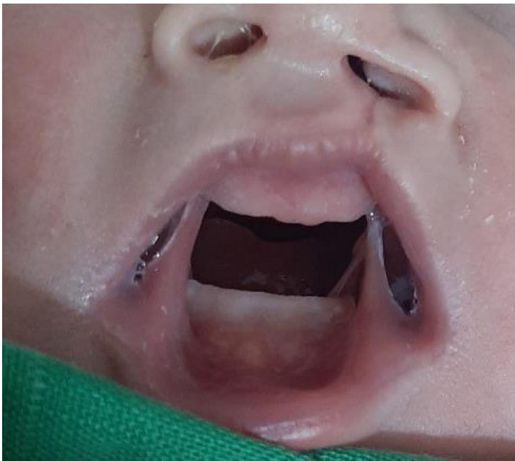
Figure 1: congenital lateral synechiae associated with cleft lip and palate