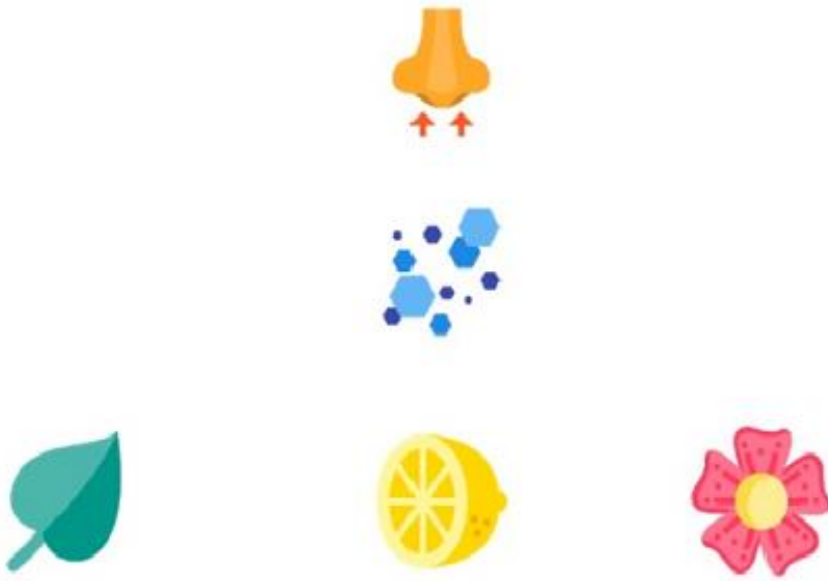
Figure 2: olfactory Training consists of sniffing items with high density molecules such as roses, lemons, cloves, or eucalyptus for 20 seconds each, twice a day for \geq 3 months. Patients who have an altered sense of smell due to COVID-19 infection have shown benefit through the use of this regimen