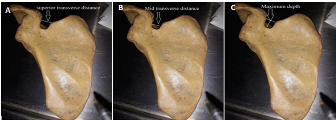
Figure 2: morphometric measurements of the suprascapular notch to assess: A) the superior transverse distance; B) mid transverse distance; C) maximum depth