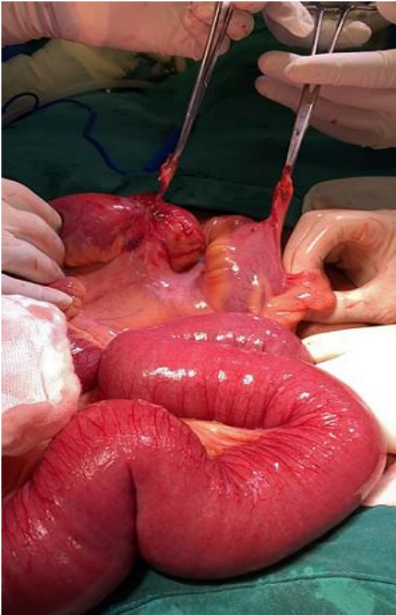
Figure 4: transected fibrous band with viable bowel