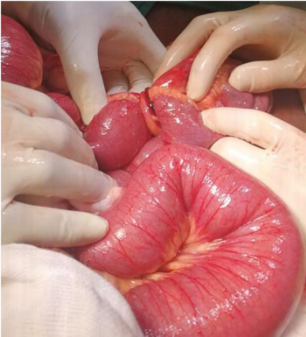
Figure 2: fibrous band encircling small bowels