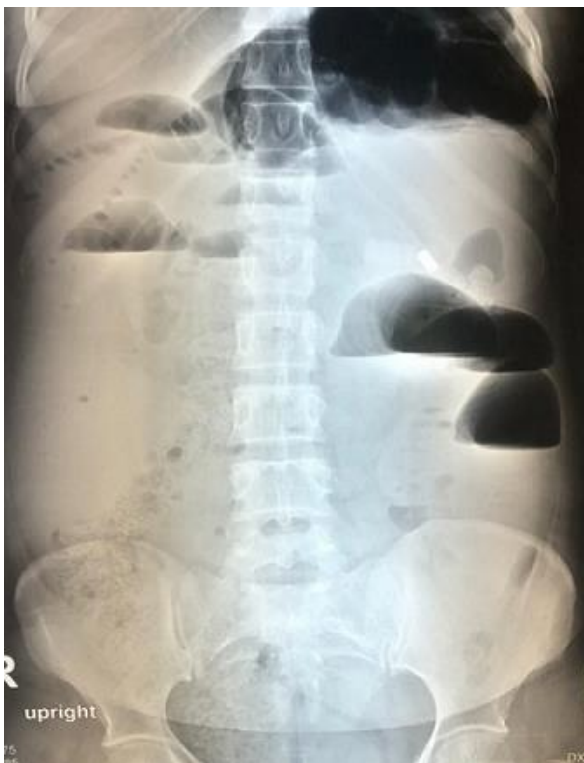
Figure 1: multiple air fluid levels