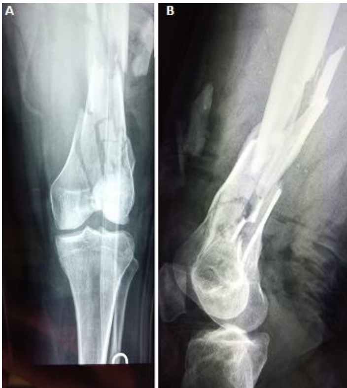
Figure 4: distal femoral fracture type C3: anteroposterior (A) and lateral (B) views of the knee