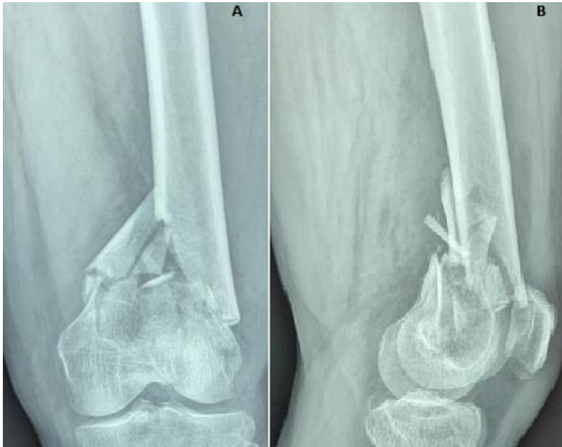
Figure 3: anteroposterior (A) and lateral (B) radiographs of a C2 type distal femoral fracture