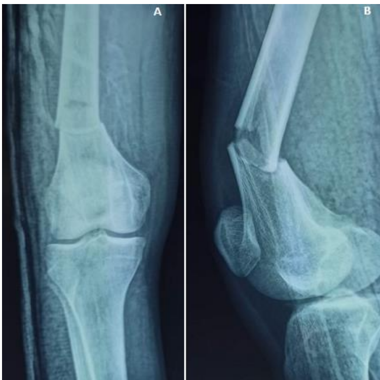
Figure 2: preoperative radiographs of the knee: anteroposterior (A) and lateral view (B); the images show distal femur fracture (A1 according to AO/OTA classification)