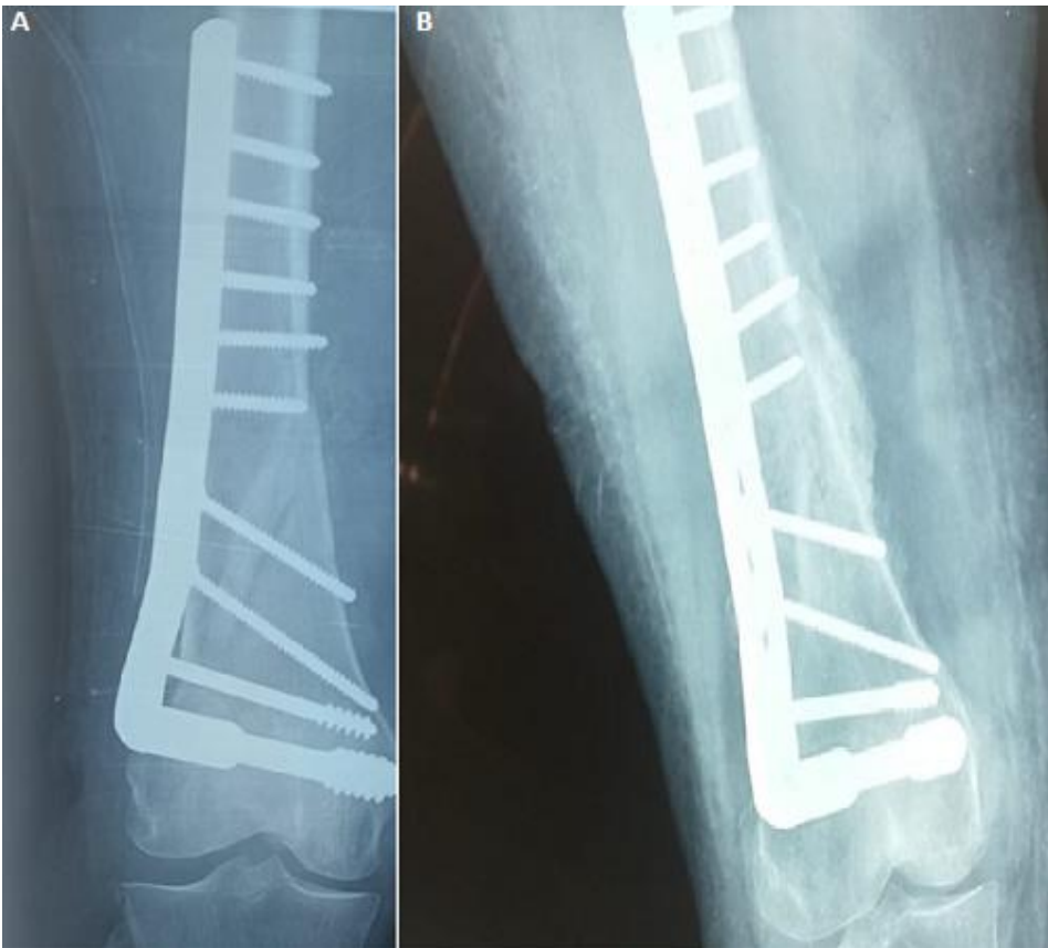
Figure 5: anteroposterior view X-rays showing good callus formation at end of four months (A) and six months (B) in an extra-articular distal femur fracture