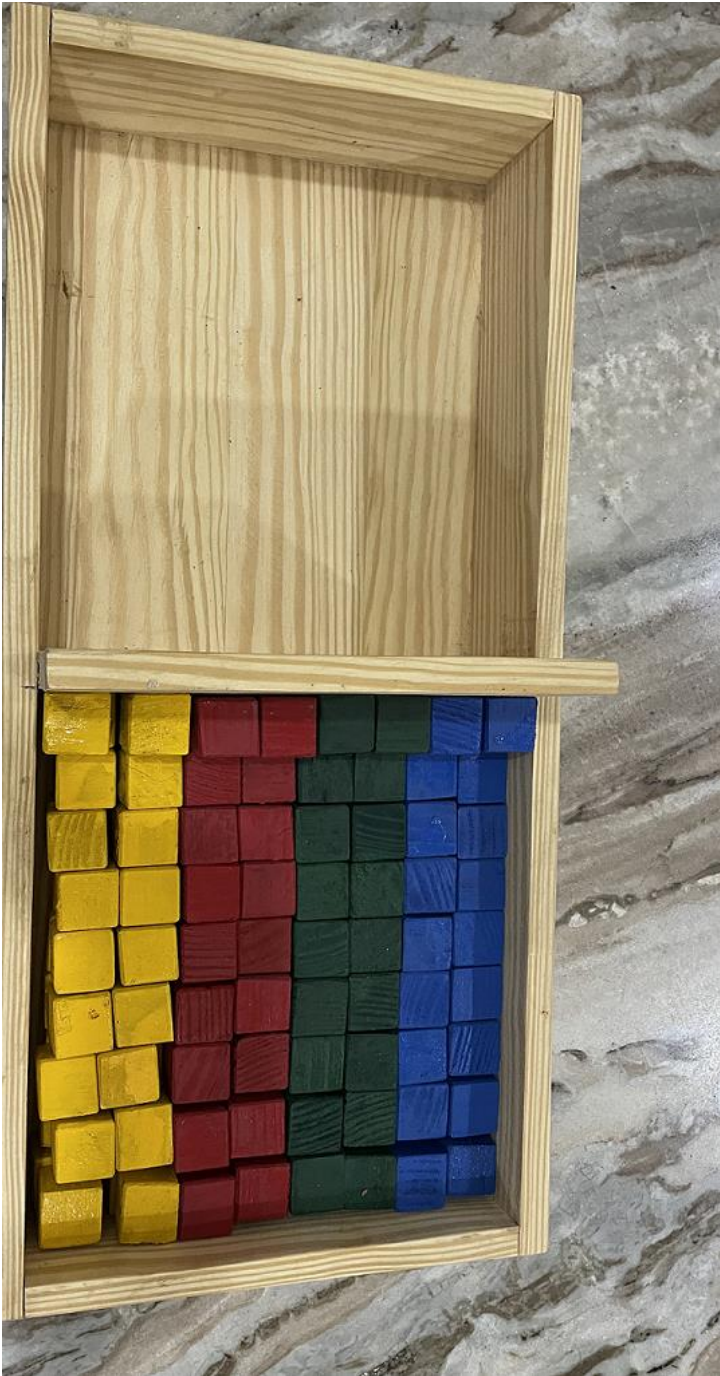
Figure 4: shows 150 blocks with a partitioned box that will be used for BBT