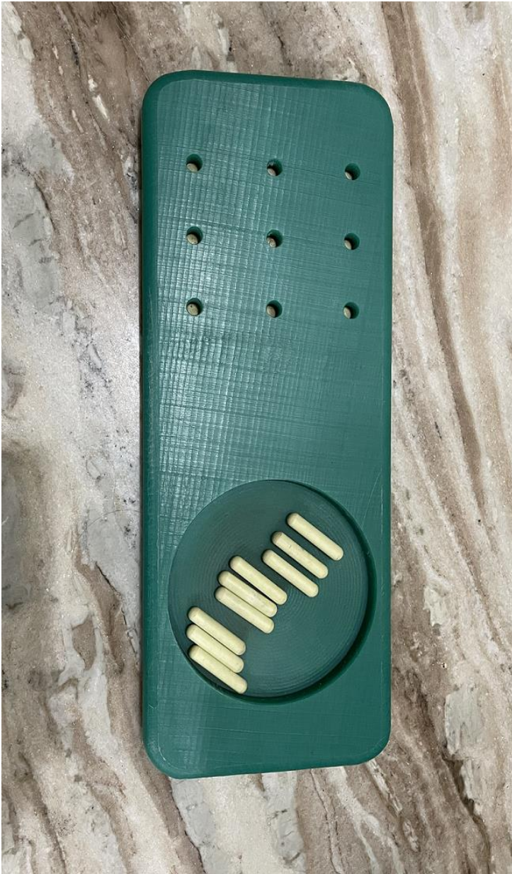
Figure 3: shows nine pegs with nine-hole peg board that will be used for 9HPT