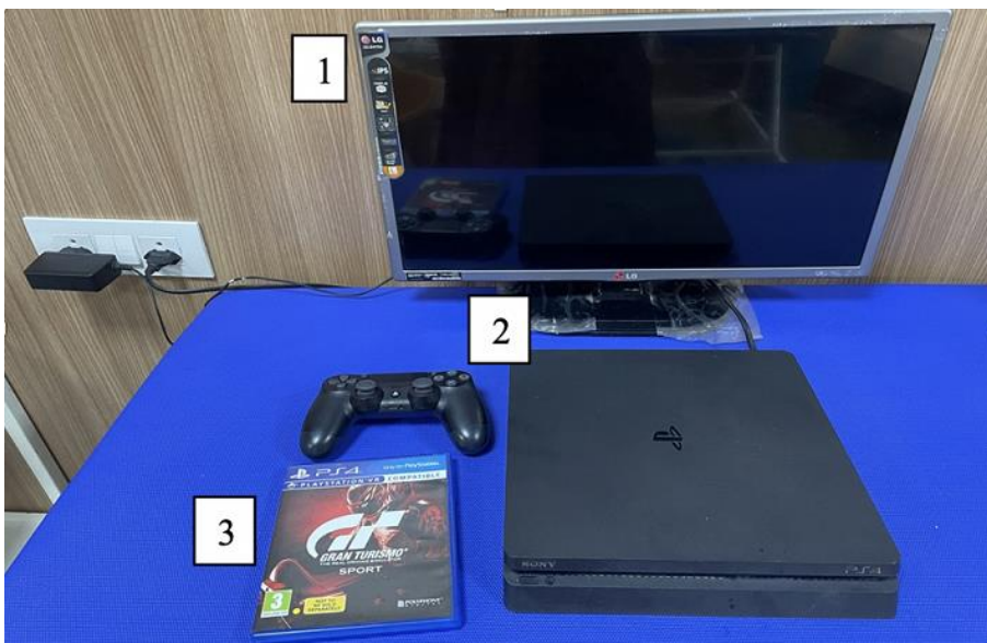
Figure 2: material that will be used for providing virtual reality and haptic feedback-based intervention for participants in the experimental group, including television screen (1), playstation 4 that provides virtual reality-based gaming with haptic feedback enhanced hand controls (2), DVD of a game named Gran Turismo- the real driving simulator (3)