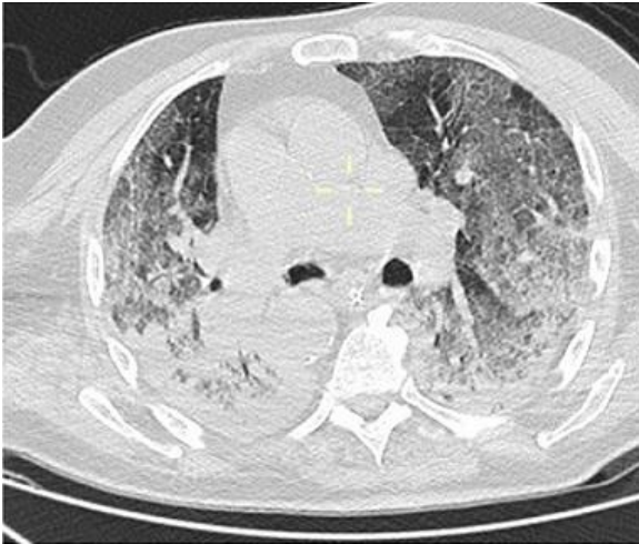
Figure 3: chest CT scan showing suggestive radiological finding related to COVID-19-pneumonia at the lung parenchyma including peripheral distribution of ground-glass opacities associated with consolidation