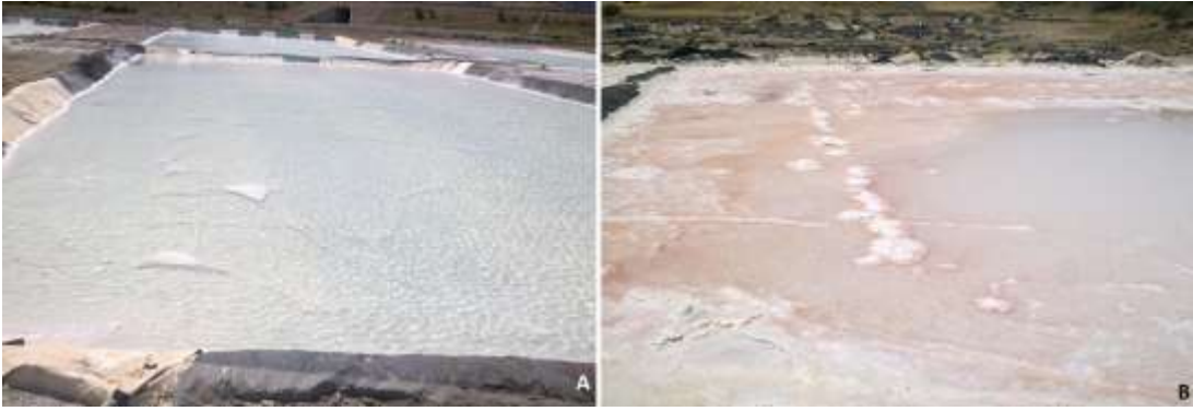
Figure 1: basins evaporation of saline water, (A) site number 1 and (B) site number 2