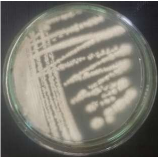
Figure 2: example of colonie of actinomycete purified on ISP-2 medium