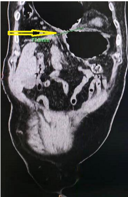
Figure 1: computed tomography scan showed the Morgagni hernia (arrow)