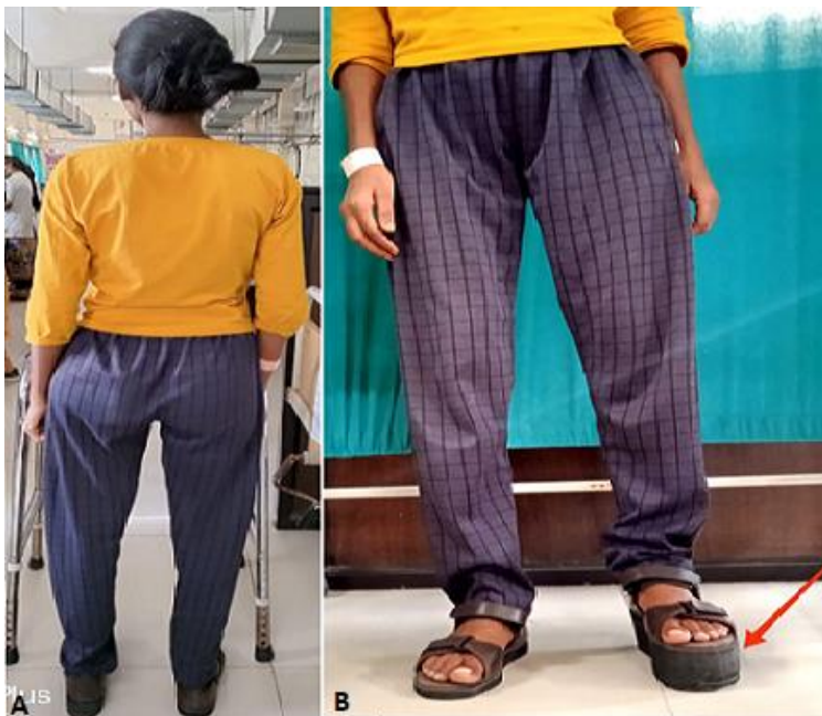
Figure 2: (A,B) post-rehabilitation figure; arrow represent the patient wears the shoe raised of 2 inches