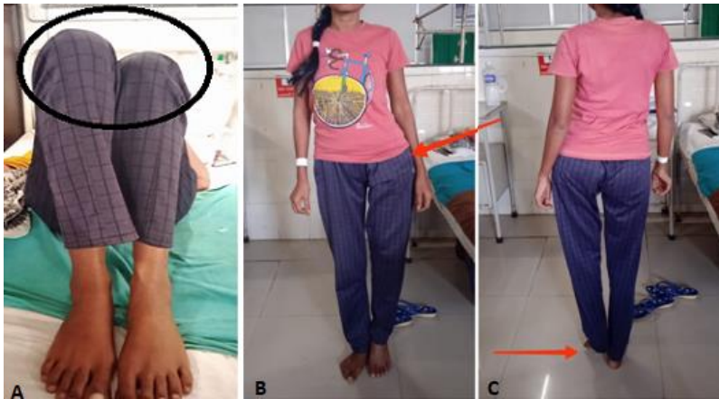
Figure 1: (A,B,C) pre-rehabilitation figure shows the limb length discrepancy of the left leg