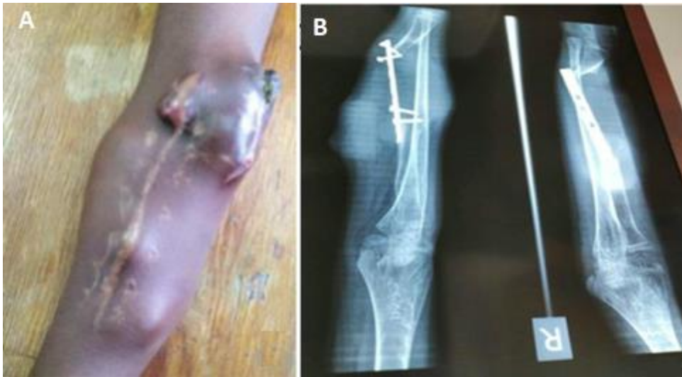
Figure 1: 15-year-old boy with diaphyseal giant cell tumor: A) multiple masses on right forearm with the most prominent at the proximal aspect of the antecubital fossa; B) radiograph of the right forearm; although image of poor quality, a relatively intact epi-metaphysis of the distal radius can be noticed; the soft tissue shadowing on a previously resected diaphysis with lytic like features and distal screws pullout are identified