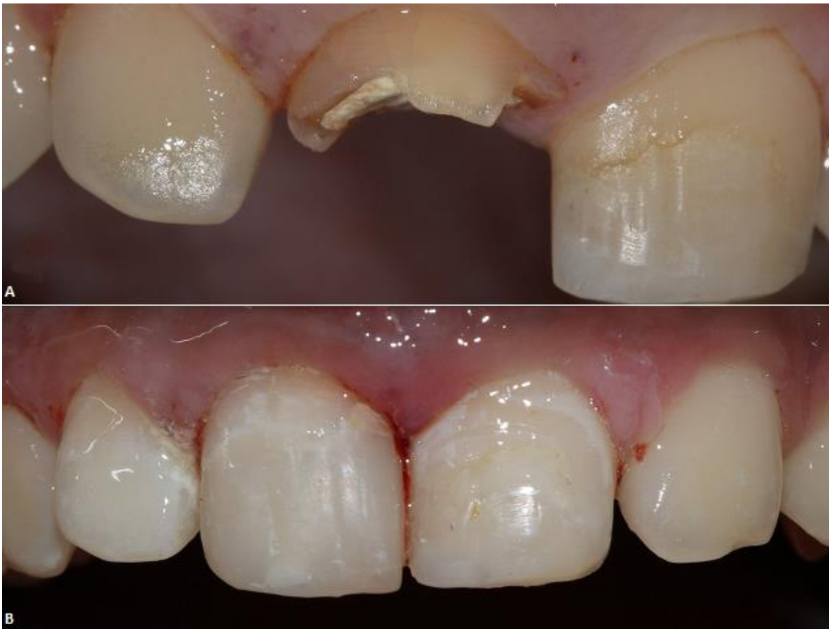
Figure 1: A) preoperative view of the amount of structure loss on maxillary right central incisor; B) postoperative view after completion of the intraradicular reinforcement and composite restoration