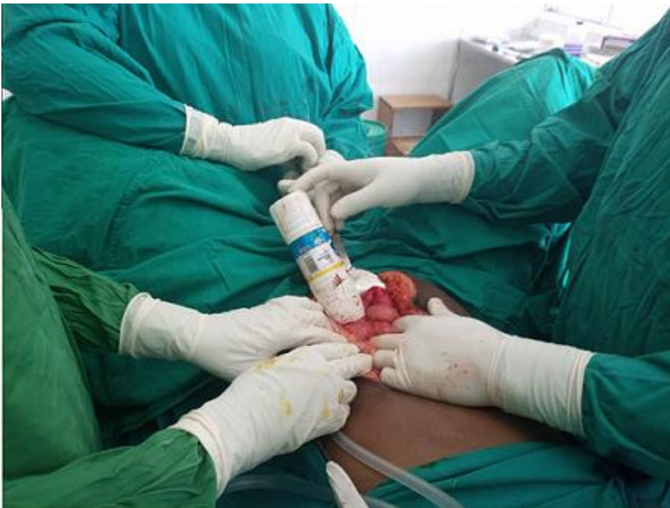
Figure 4: surgical removal of a foreign body (250mls plastic bottle) and a visualized colon laceration