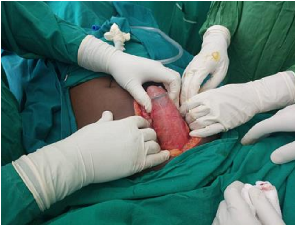
Figure 3: a foreign body (250mls plastic bottle) in the rectum and sigmoid colon