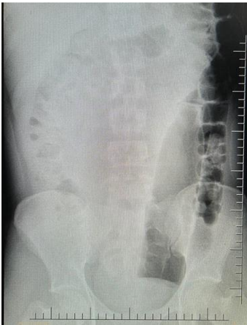
Figure 1: plain abdominal X-ray showing a lucent foreign body on the left side with proximal tapering